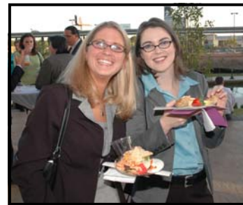
Attendees enjoy the fine fare at the reception held on the Bricktown Canal

Monday evening’s Redbud Awards dinner presentation honored the best of Oklahoma’s tourism attractions, events and marketing efforts.